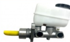
Brake Master Cylinder