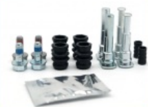
Brake Repair Kit