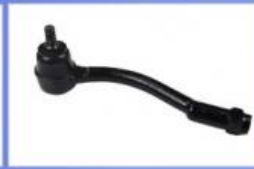
Tie Rod End