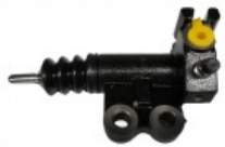
Brake Slave Cylinder