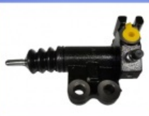
Brake Slave Cylinder