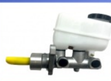
Brake Master Cylinder