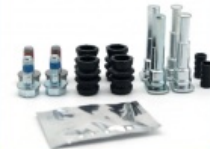
Brake Repair Kit