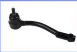
Tie Rod End