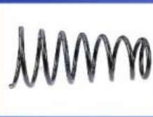
Shock Absorber Spring